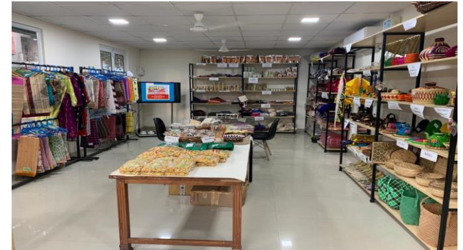
NCUI's Skill Development Centre in Noida